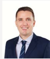
Jacob Lea Business Services