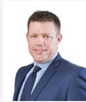
Dennis Barnett Business Services